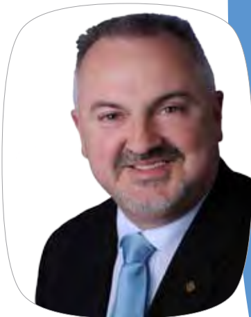
Keith Rhoades AFSM Mayor, City of Coffs Harbour