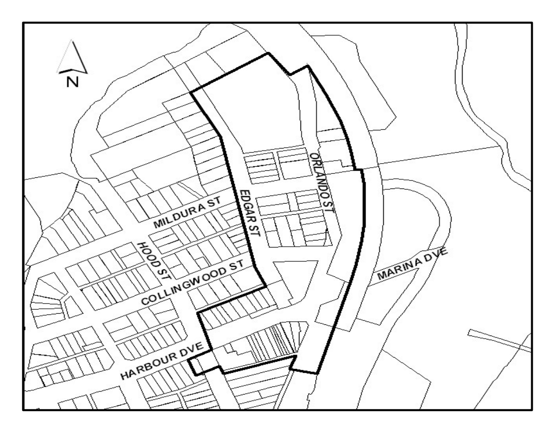
MAP 2 - Jetty Area Car Parking