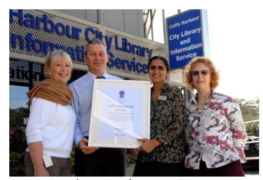
'Your Tutor' presentation

The library had a busy year of author events and community activities, and won special recognition from Tutoring Australasia for the long-running provision of the successful online student-help service "Yourtutor"