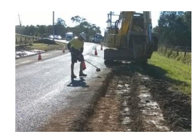
Red Rock cycleway construction

city centre and the Base Hospital/Boambee, along Solitary Island Way at Sandy Beach, and the commencement of stage one of a new shared footpath/cycleway along Red Rock Road from Corindi Primary School to the southern boundary of Yuraygir National Park.