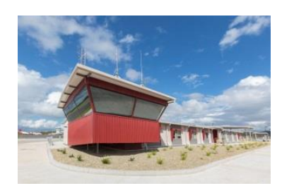
New aviation fire rescue

A new $11.4m aviation rescue fire station was opened at Coffs Harbour Regional Airport. The station is staffed by 17 specialist fire fighters employed by Airservices Australia.