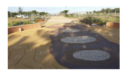
New Jetty Foreshore walkway

Meanwhile, the community consultation strategy for the Jetty4Shores Project won the top Public Engagement and Community Planning honour at the2014 Planning Institute of Australia NSW Awards for Planning Excellence. The award recognised the strong vision set for the project and its success in securing community consensus and a balanced outcome.