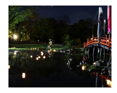
Japanese Lantern Festival

Coffs Harbour's Botanic Garden glittered with more than flowers in October when hundreds of lanterns were floated on the lake as part of the annual Japanese Lantern Festival. Proceeds from the popular event go towards further development of the Japanese Garden project.