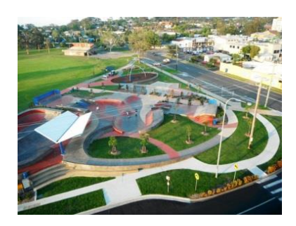
Coffs Harbour Skate Park

The long-awaited Skate Plaza at Brelsford Park was officially opened in July 2014. The opening celebrations included demonstrations by expert BMX and skate riders and a free mini music festival featuring local bands. The facility has quickly proved to be a popular attraction, not just for the youth of Coffs Harbour, but as a drawcard for the whole region.