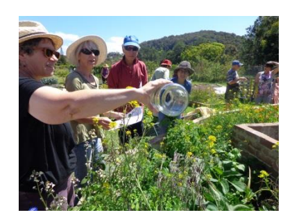
Regional Community Gardens

Council has supported the creation of a community garden near the local netball courts in Nightingale Street, Woolgoolga. The Woolgoolga Regional Community Garden Inc received a $5,000 Southern Phone Grant to commence the project.