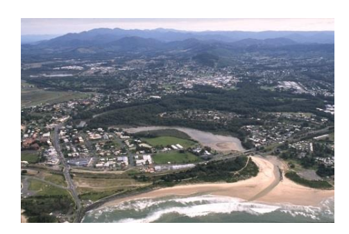
Coffs Creek Estuary

Council's draft 'Landscape Corridors of the Coffs Harbour Local Government Area' documents were released for public comment in September. The consultation will guide the eventual development of a new Priority Habitats and Corridors Strategy to help maintain the health of animal and plant habitats.