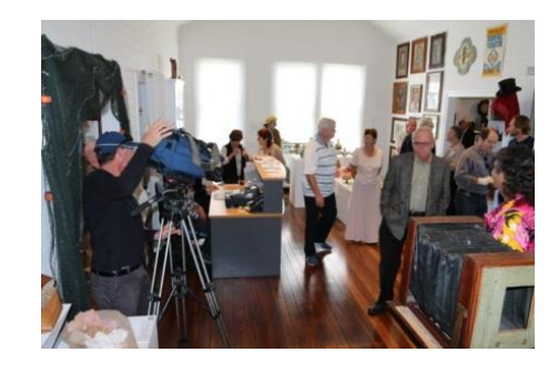
Regional Museum re-opening

The Regional Museum, in the Old Courthouse on Harbour Drive, opened its doors to visitors again for the first time in August. The Museum's themed exhibition spaces take visitors from the area's earliest days right up to the present and local Indigenous culture takes pride of place along with Coffs Harbour's maritime history.