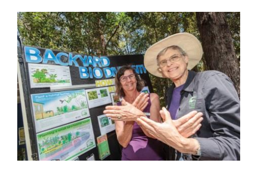
Sustainable Living Festival