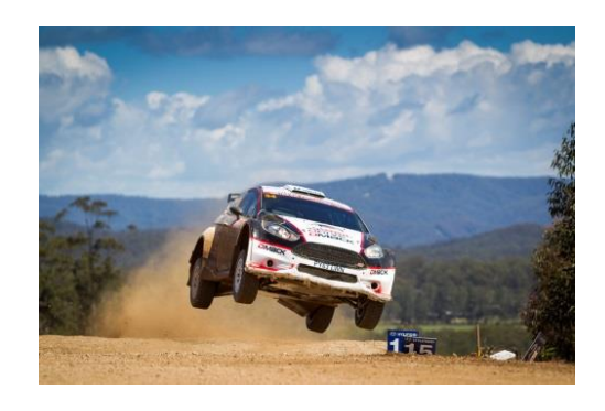
World Rally Championship

In September, Coffs Harbour successfully hosted the Australian round of the 2014 World Rally Championship and a round of the Australian Off-Road Championship. The events generated an estimated $13.8M into the local economy and Council will again sponsor the event in 2015.