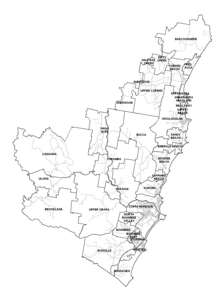
City of Coffs LGA "A"