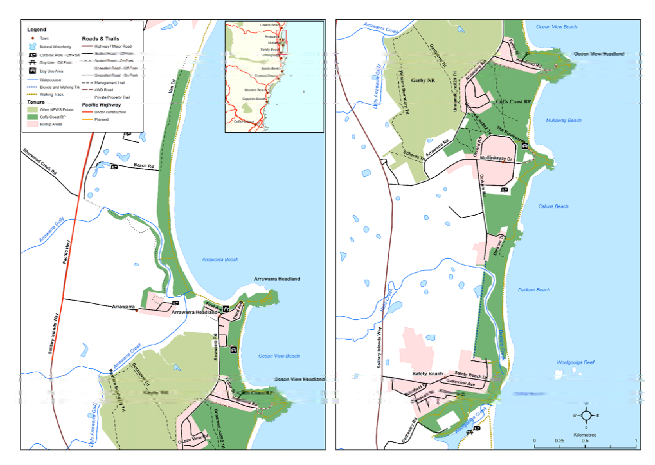
Fig 1: Northern Section of Coffs Coast Regional Park