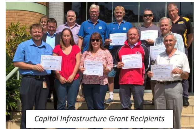
Capital Infrastructure Grant Recipients

Visitation: 568,401 (2015/16 - 691,463) Rescues: 19 (46) Patrol days: 731 + 3-days that beaches were closed due to environmental factors. (740 +10) Preventative actions: 13,852 (24,220) First Aid incidents treated: 401 (79) Law Enforcement (dog, surf craft and other incidents): 442 (525)