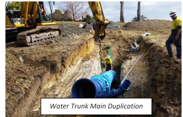
Water Trunk Main Duplication