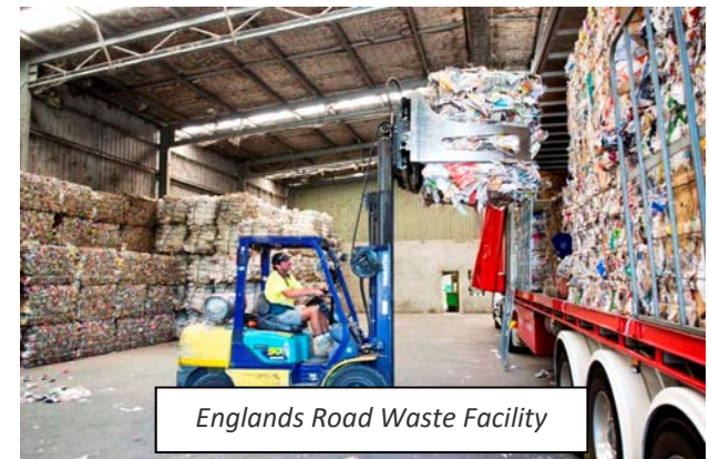
Englands Road Waste Facility