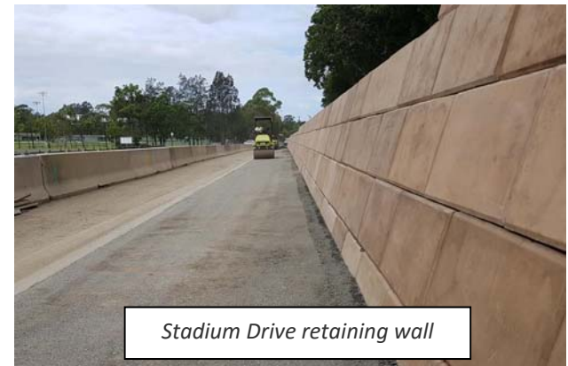
Stadium Drive retaining wall