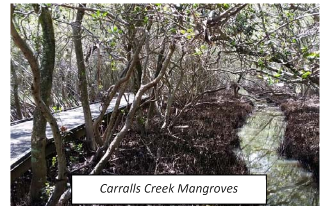
Carralls Creek Mangroves