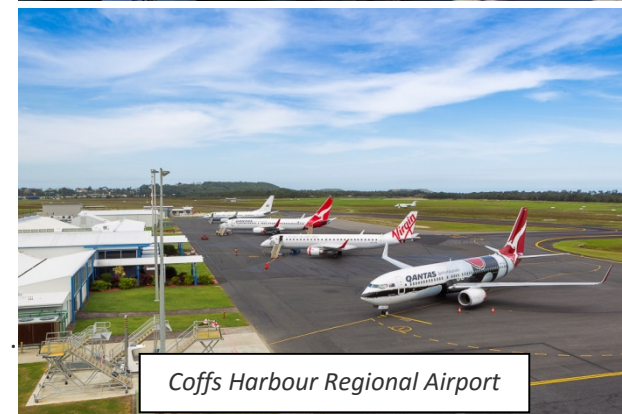
Coffs Harbour Regional Airport