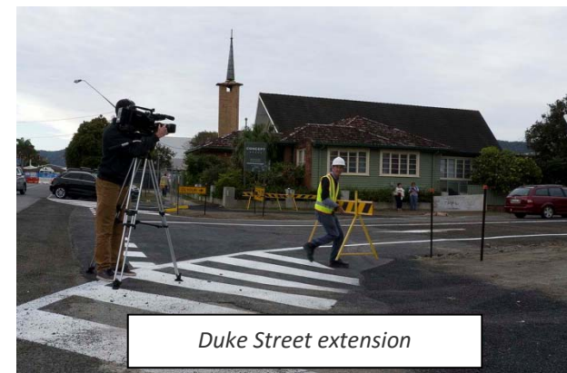
Duke Street extension