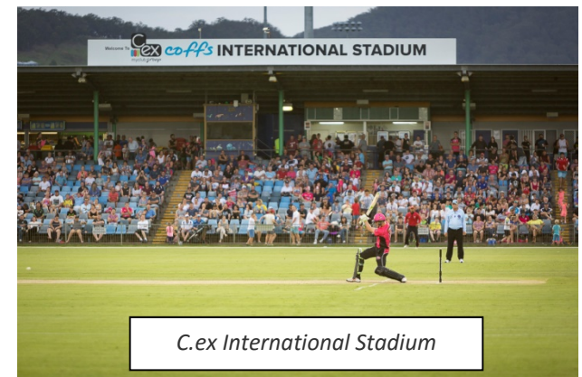
C.ex International Stadium