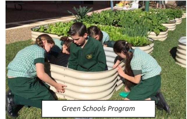
Green Schools Program

CHCC GREENHOUSE GAS EMISSIONS 2016/17 = 18,278 (tonnes CO2 equivalent) (2015/16 = 18,007 tCO2e)