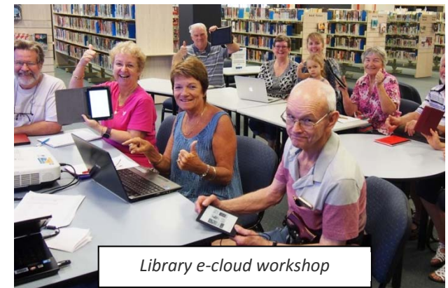
Library e-cloud workshop