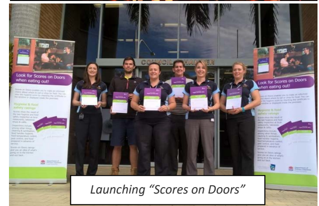
Launching “Scores on Doors”