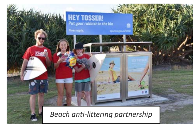
Beach anti-littering partnership