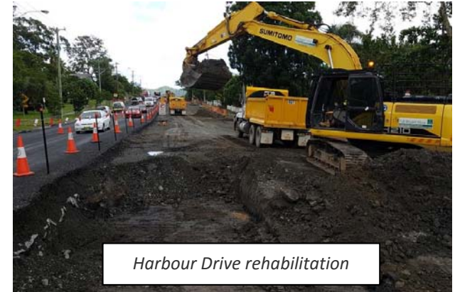
Harbour Drive rehabilitation

AIRPORT PASSENGER NUMBERS 413,000 (NEW RECORD) 2015/16: 377,305