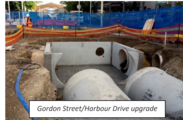
Gordon Street/Harbour Drive upgrade

With NSW Government funding assistance, Council continued its program to update bus shelters across the Coffs Harbour local government area. Shelters in Azalea Avenue, Coffs Harbour, and Pacific Street, Corindi, were renewed while new shelters were installed at Solitary Islands Way near Sapphire Crescent, Nightingale Street in Woolgoolga and at Sandy Beach Drive, Sandy Beach.