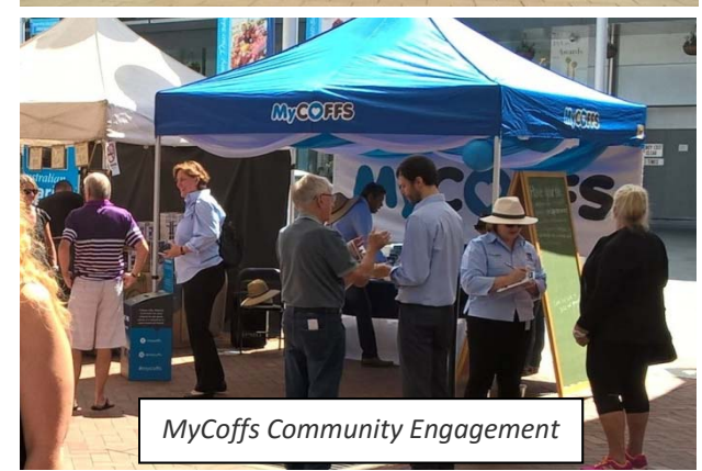
MyCoffs Community Engagement