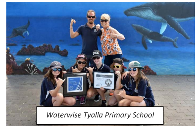
Waterwise Tyalla Primary School