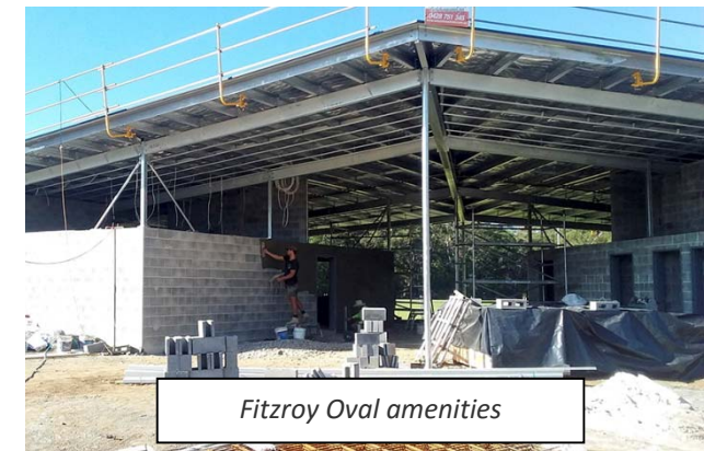
Fitzroy Oval amenities