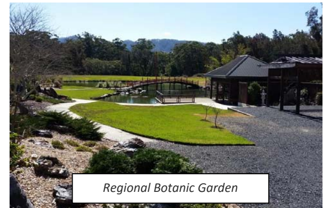
Regional Botanic Garden