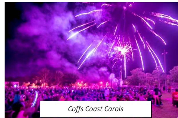
Coffs Coast Carols