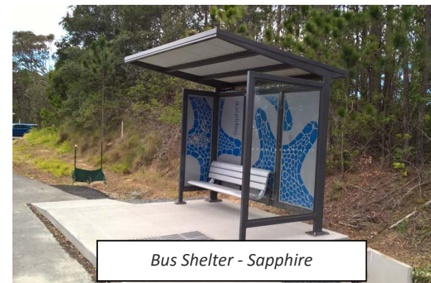
Bus Shelter - Sapphire