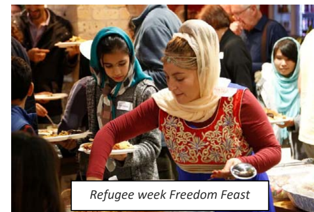
Refugee week Freedom Feast