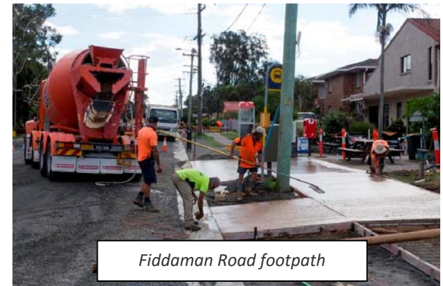
Fiddaman Road footpath