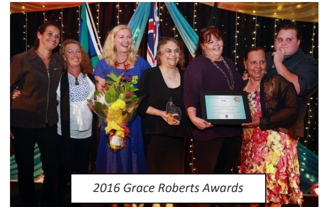
2016 Grace Roberts Awards

The comprehensive MyCoffs engagement was successfully completed during the year, resulting in Council’s adoption of the MyCoffs Community Strategic Plan in June 2017. More than three thousand people participated in the phased consultation process to establish a vision, objectives and priorities for Coffs Harbour for the next ten years and beyond.