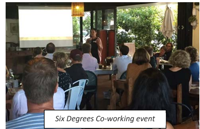
Six Degrees Co-working event