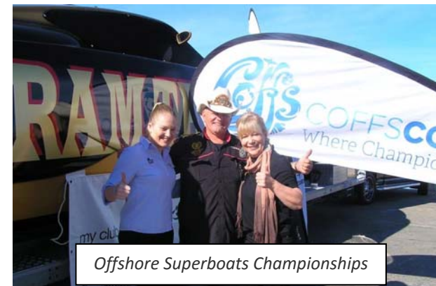
Offshore Superboats Championships

Council continued its support for emerging enterprise through its Six Degrees Co-working initiative, extending its successful ‘Pitch’ event program to Woolgoolga. Council also partnered with the Telstra Business Centre to stage STARTUP COFFS COAST, providing $33,000 in prize money and support for innovative business ventures.