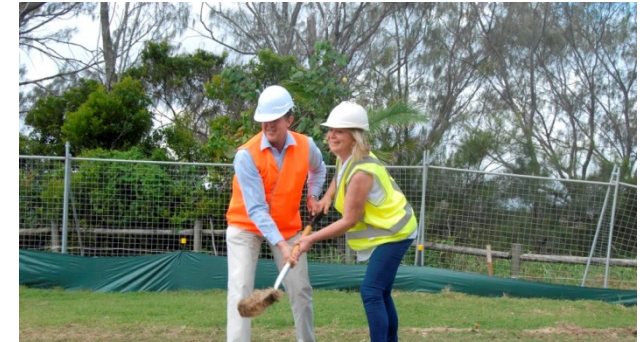
Turning the sod - Jetty4Shores Project – Stages 2-4

Work progressed on the construction of a new multi-purpose building at Fitzroy Oval in Coffs Harbour’s CBD. Council also endorsed the dual naming of the oval in English and Gumbaynggirr language; ‘The Old Camp – Yaam Nguura Jalumgal’ commemorates the site as an Aboriginal settlement last century.