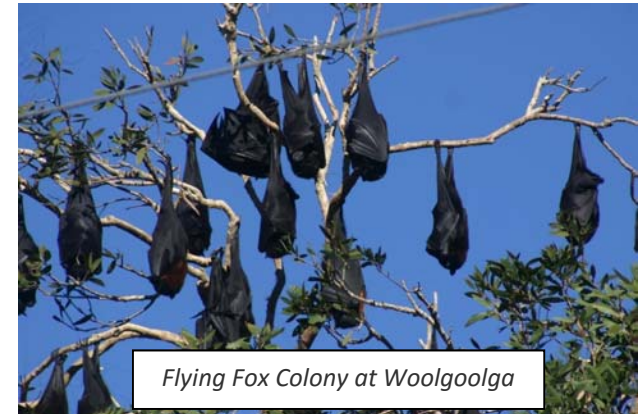
Flying Fox Colony at Woolgoolga

VOLUME OF WASTE TO LANDFILL 2016/17 38,074 tonnes (2015/16 - 28,644 tonnes)* *Reduced resource recovery while the Biomass plant was out of operation