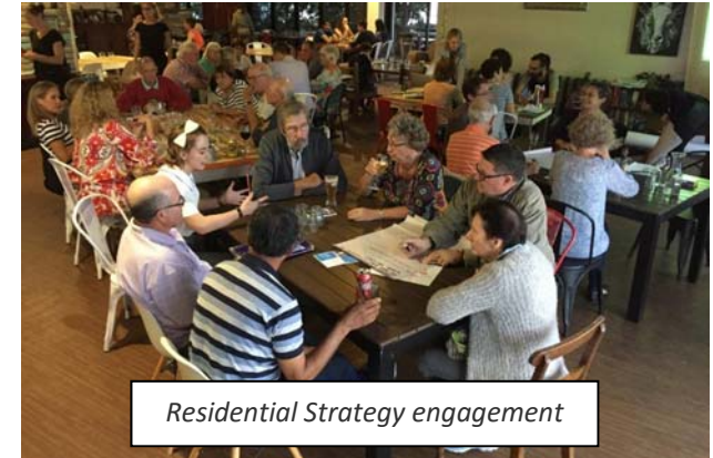
Residential Strategy engagement

Council’s success in looking after the Coffs Coast State Park saw it nominated as a finalist in the 2016 NSW/ACT Regional Achievement and Community Awards. The State Park encompasses high value coastal Crown reserves including the Jetty Foreshores, Park Beach Reserve, Sawtell Reserve and Woolgoolga Beach Reserve.