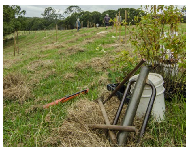
Riparian revegetation.