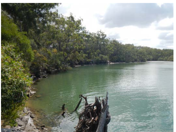
A healthy intact riparian zone in Coffs Creek estuary.

Coffs Harbour City Council has been actively removing large stands of Camphor Laurel and other environmental weeds and revegetating cleared or degraded creek banks throughout Council reserves and crown lands over the last 18 years. Regeneration and revegetation works have been undertaken in Coffs, Boambee, Bonville and Moonee Creeks and Woolgoolga Lake. Council also supports a number of environmental projects including the Jaliigirr project that rehabilitates degraded riparian areas in the coastal zone on both public and private land. The Friends of Coffs Creek Landcare group have been actively working on estuarine areas for over 20 years. Works include track construction, bush regeneration, revegetation and rubbish collection. Other local Landcare groups work at a number of other estuarine sites including Woolgoolga Lake and Moonee Creek.