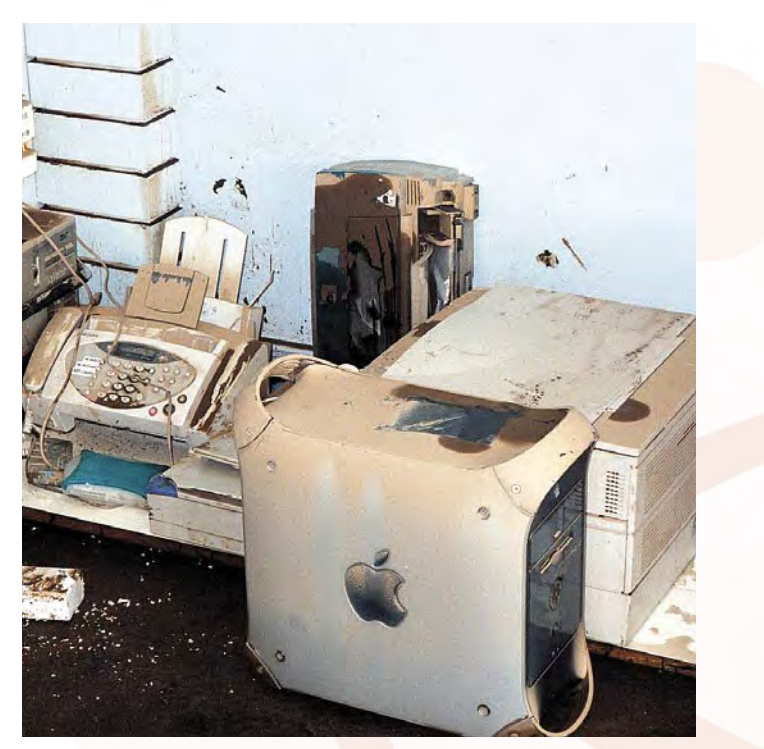
Flood damaged business property