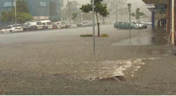
Location: Flash flooding affects Coffs Harbour