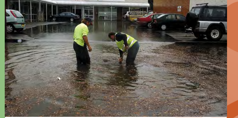
Inadequate drains in Park Avenue