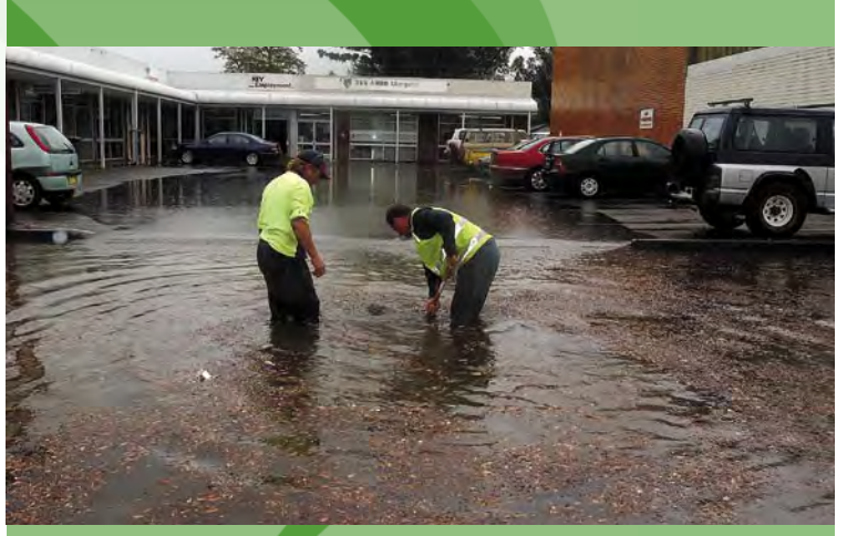
Location: Council workers unblock drains following heavy rainfall

Very heavy rainfall is a natural warning sign that flooding may occur.