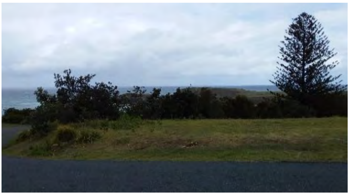
Figure 5.4.15: Signal Street parcel

The land possesses a range of mapped attributes including: