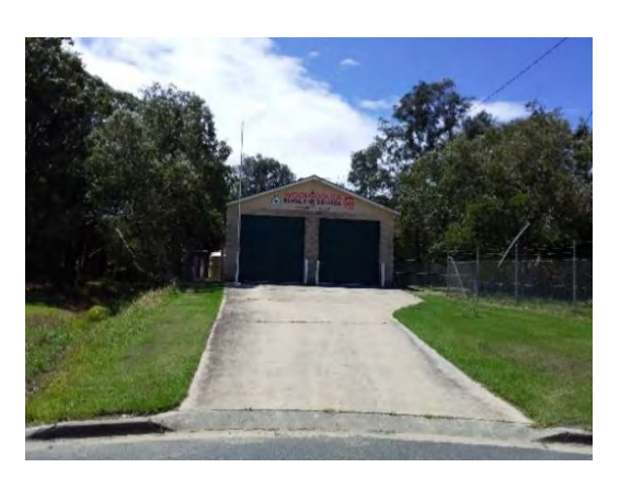
Figure 5.4.28: Woolgoolga RFS station on Ganderton Street