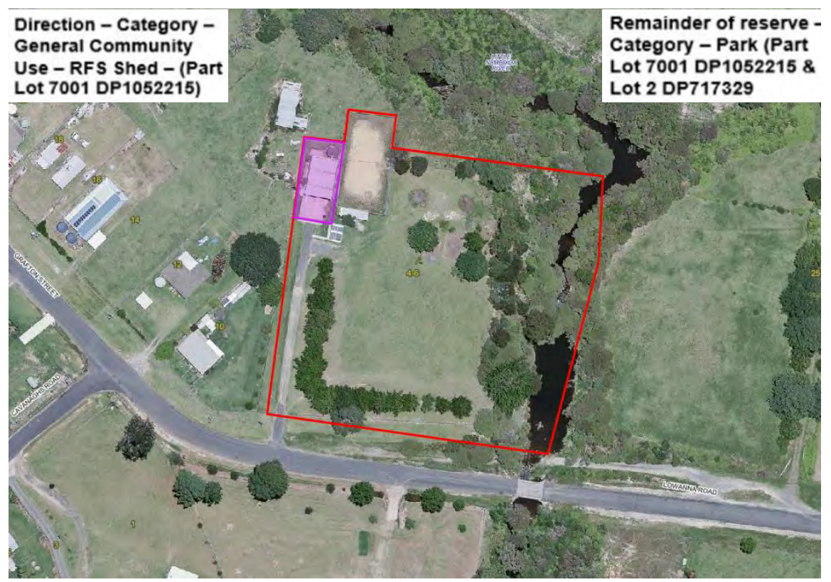
Figure 5.4.32A: Aerial view Lowanna village reserve R85692 showing categorisation

Current management of the reserve includes vegetation/weed management and regular slashing/mowing is undertaken by contractors. Future actions may include upgrades to the playground and or re-development of the old tennis court into new sporting or recreational facilities. The reserve forms the Lowanna base for the RFS with the shed housing its firefighting equipment. The land is mapped Category 2 and 3 Bushfire Prone Land.