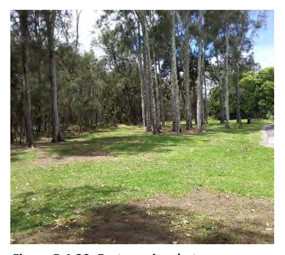
Figure 5.4.20: Eastern view between Woolgoolga Creek and caravan park