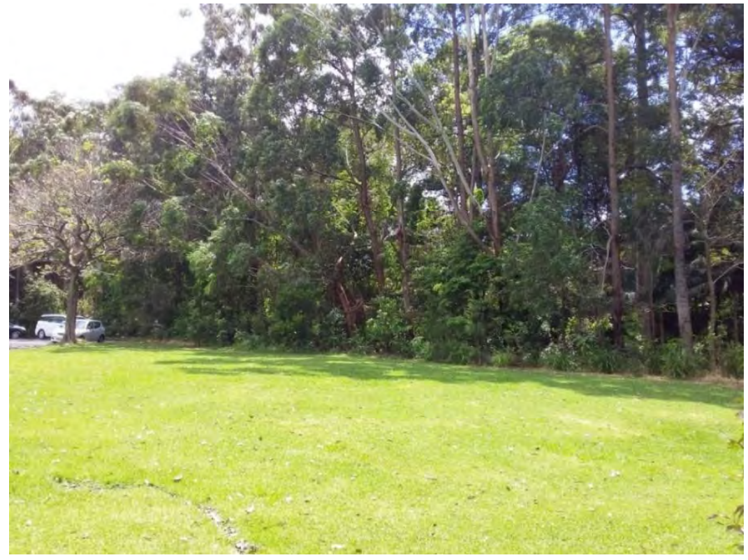
Figure 5.4.4: Street view Moonee Street reserve