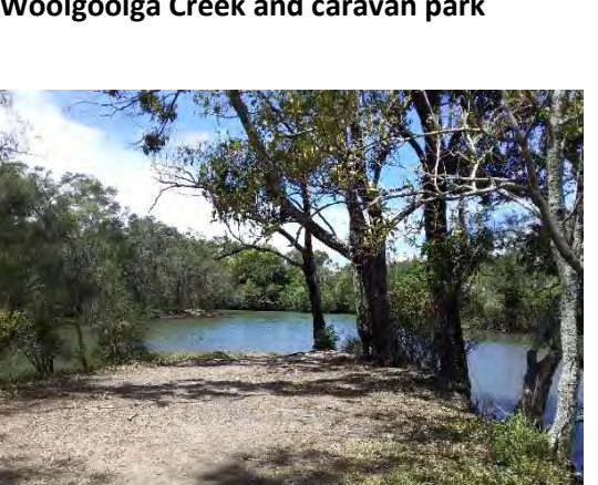
Figure 5.4.22: Eastern boundary