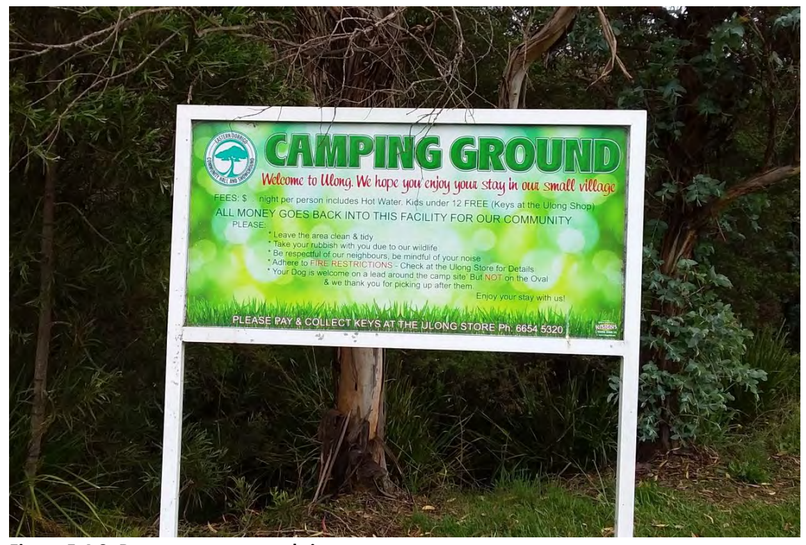
Figure 5.4.9: Reserve campground sign