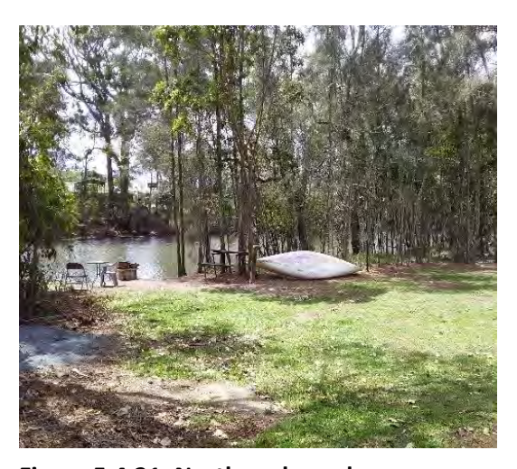
Figure 5.4.21: Northern boundary Woolgoolga Creek