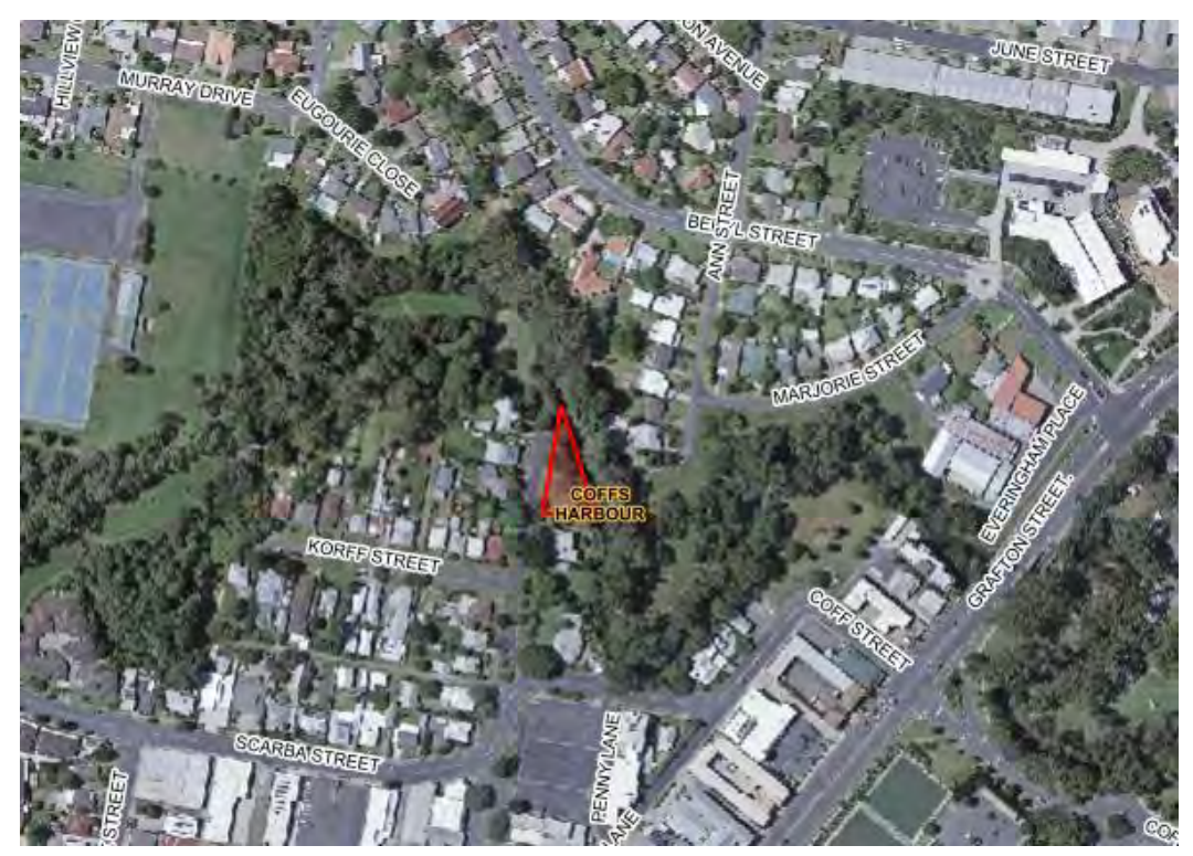
Figure 5.4.3: Aerial image Moonee Street reserve R87080

The reserve is comprised of open space at the end of the cul-de-sac with direct access to Coffs Creek through an open understory of native vegetation. There are no facilities located on the reserve.