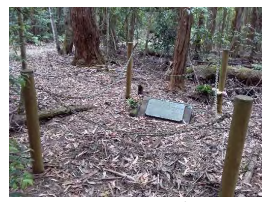
Figure 5.4.31: Grave on side of access track