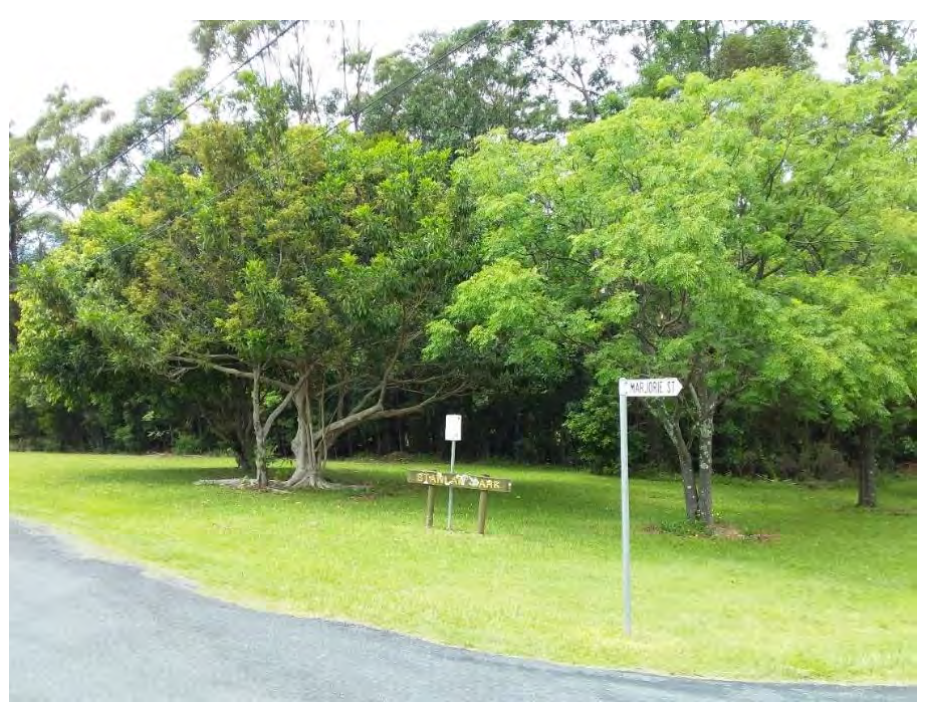
Figure 5.4.2: Street view Stanlan Park reserve

The land possesses a range of natural values and attributes with the most significant of these being: