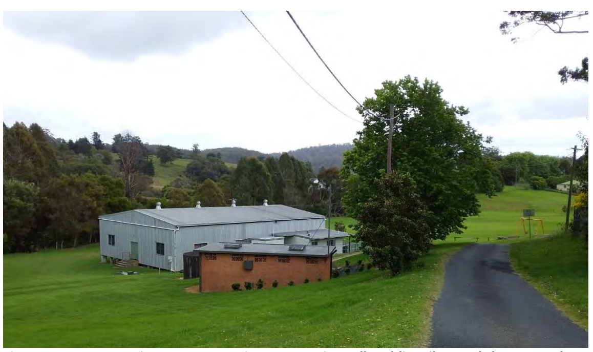
Figure 5.4.11: Street view Eastern Dorrigo Community Hall, public toilets and showground