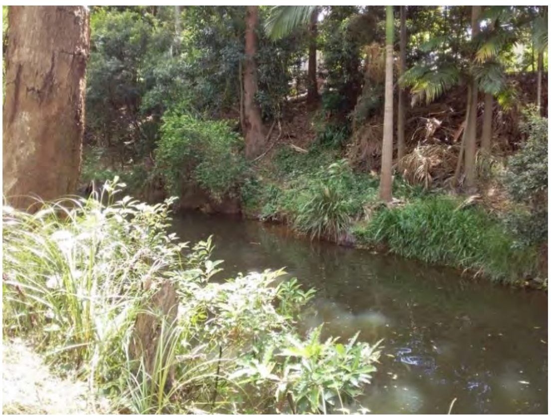
Figure 5.4.5: Coffs Creek at Moonee Street reserve

Current management of the reserve is limited to vegetation/weed management and is included on Council's slashing/mowing schedule of up to every 2 weeks, depending on season.