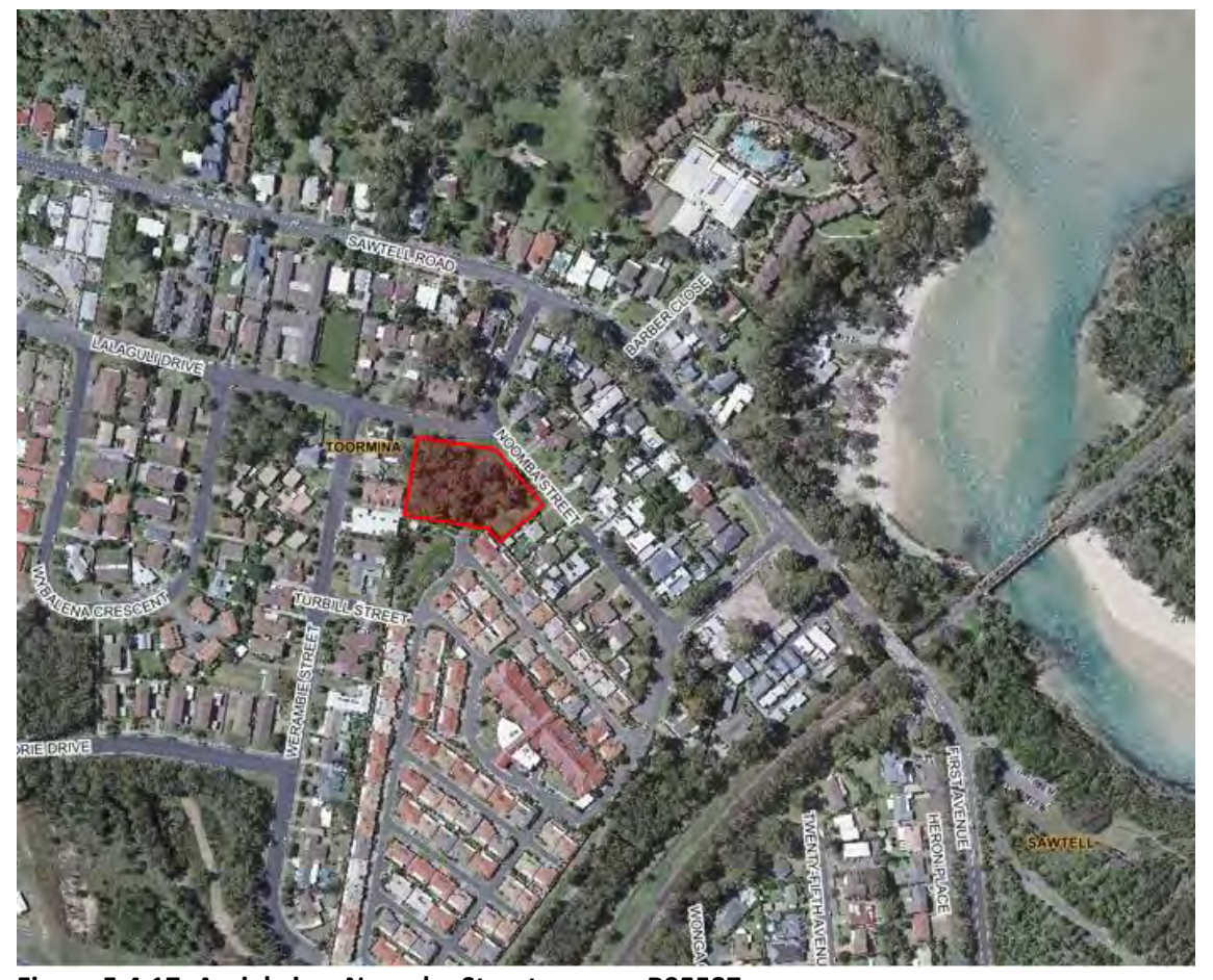
Figure 5.4.17: Aerial view Noomba Street reserve R95587

Current management of the reserve includes vegetation/weed management and it is included on Council's slashing/mowing schedule of up to every 2 weeks, depending on season.