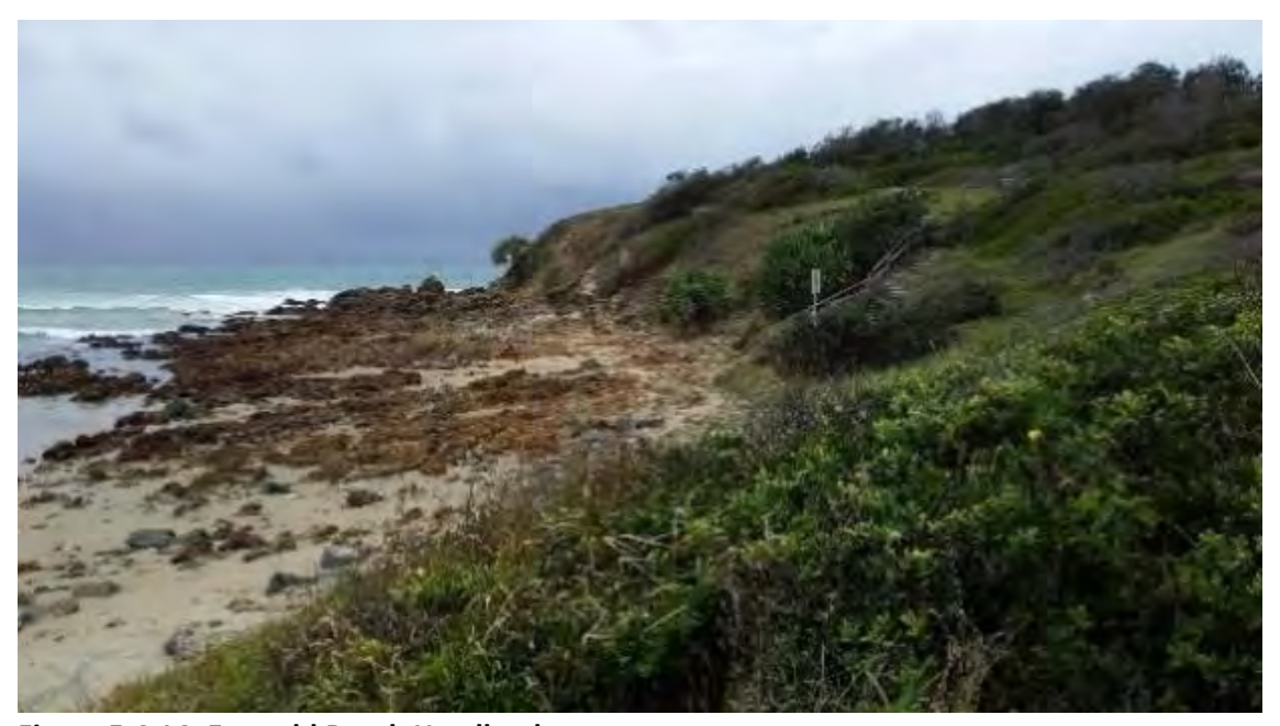
Figure 5.4.14: Emerald Beach Headland

The Emerald Beach foreshore area is also undergoing a master planning process. Although the Crown reserves are at the periphery of this work, any outcomes resulting from this process may be applied to the reserves.