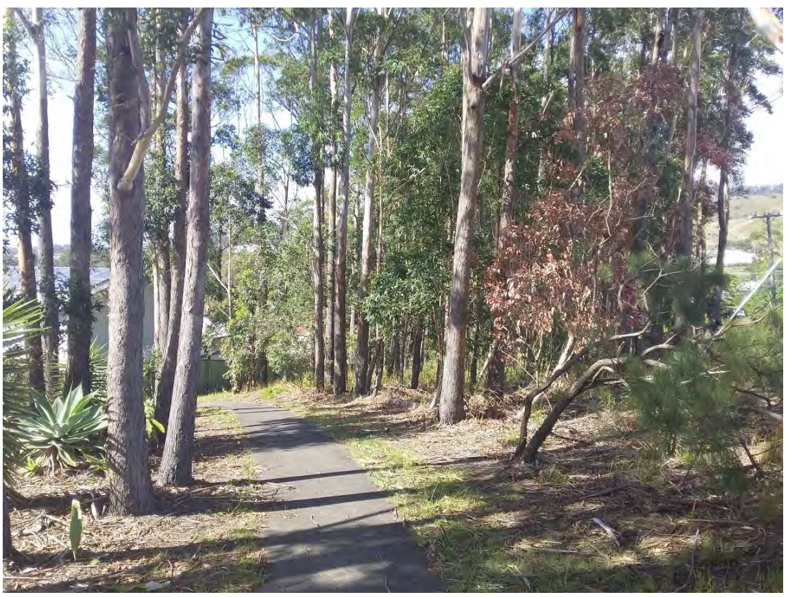
Figure 5.4.25: Street view River St Woolgoolga reserve

Current management of the reserve includes footpath maintenance, vegetation/weed management and it is included on Council's slashing/mowing schedule of up to every 2 weeks, depending on season.