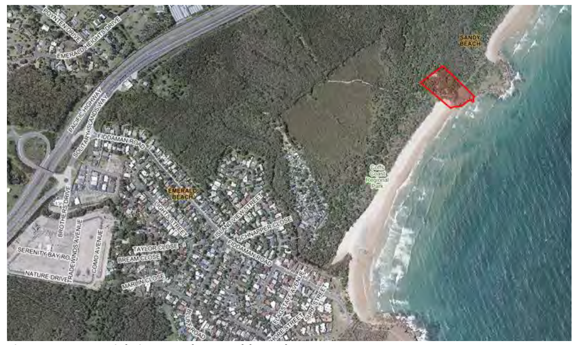
Figure 5.4.16: Aerial view North Emerald Beach reserve R93479

Given the restricted access and limited public use there is no active management by Council although there may be future measures such as invasive species control in co-operation with the NPWS.