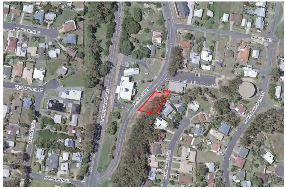
Figure 5.4.24: Aerial view River St Woolgoolga reserve R140070

Directly opposite the Guru Nanak Sikh Temple on River Street, the land is comprised of a Dry Sclerophyll Forest vegetation community and some open space. The only infrastructure on the land is a footpath used for access to the adjacent residential areas.