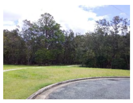
Figure 5.4.27: Boundary St view north