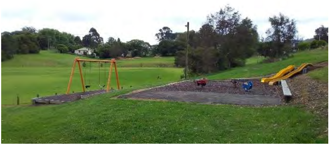
Figure 5.4.10: Reserve playground

Council maintains the playground and open space. Contractors are employed to mow on a regular basis and the playground is on Council's quarterly safety inspection schedule. The Venue Management Committee manages camping on the reserve and the use of the sportsground.