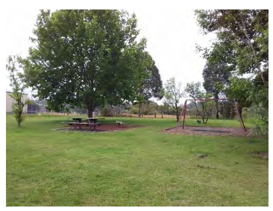
Figure 5.4.35: Playground & picnic table

There are no significant changes to management proposed for the reserve at the time this PoM was prepared. However, Council commits to facilitate any future variations in management that the RFS may require, and this PoM authorises any form of works necessary to improve the utility of the land or structures for emergency services use.