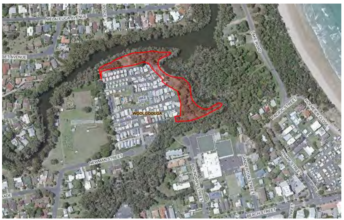
Figure 5.4.19: Aerial view Sunset reserve R140004