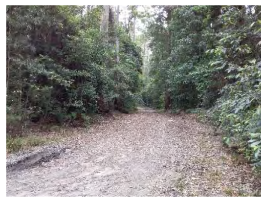
Figure 5.4.30: Access track off Bushmans Range Road

Despite being heavily overgrown and with physical evidence of most burials being very difficult to find, it is still of local significance as the former cemetery for Lowanna. It provides a record of the early development of the village and surrounding districts. The former Lowanna Cemetery forms a group with other early cemeteries and pioneer gravesites within the Coffs Harbour Local Government Area. These sites are some of the earliest surviving built remains of the pioneering community, and are a reminder of the hardships of pioneer settlement.