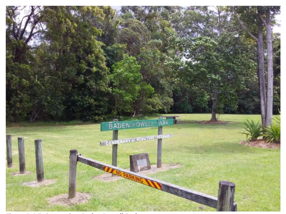
Figure 5.4.7: Street view Baden Powell Park reserve

The land possesses a range of mapped attributes including: