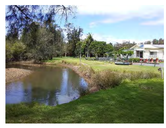
Figure 5.4.23: Northern side of reserve view south between tidal tributary and caravan park