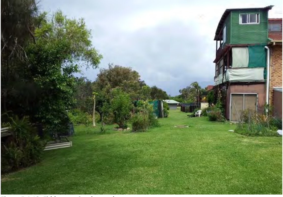
Figure 5.4.13: Fiddamans Creek parcel