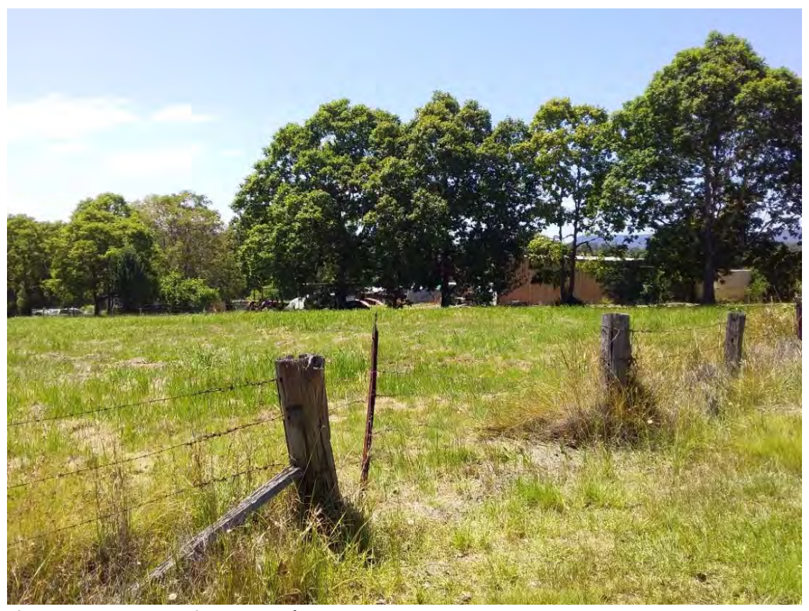
Figure 5.4.40: Street view Nana Glen reserve