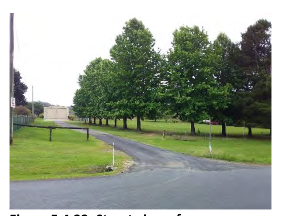
Figure 5.4.33: Street view of reserve

Current management of the reserve includes vegetation/weed management and regular slashing/mowing is undertaken by contractors. Future actions may include upgrades to the playground and or re-development of the old tennis court into new sporting or recreational facilities. The reserve forms the Lowanna base for the RFS with the shed housing its firefighting equipment. The land is mapped Category 2 and 3 Bushfire Prone Land.