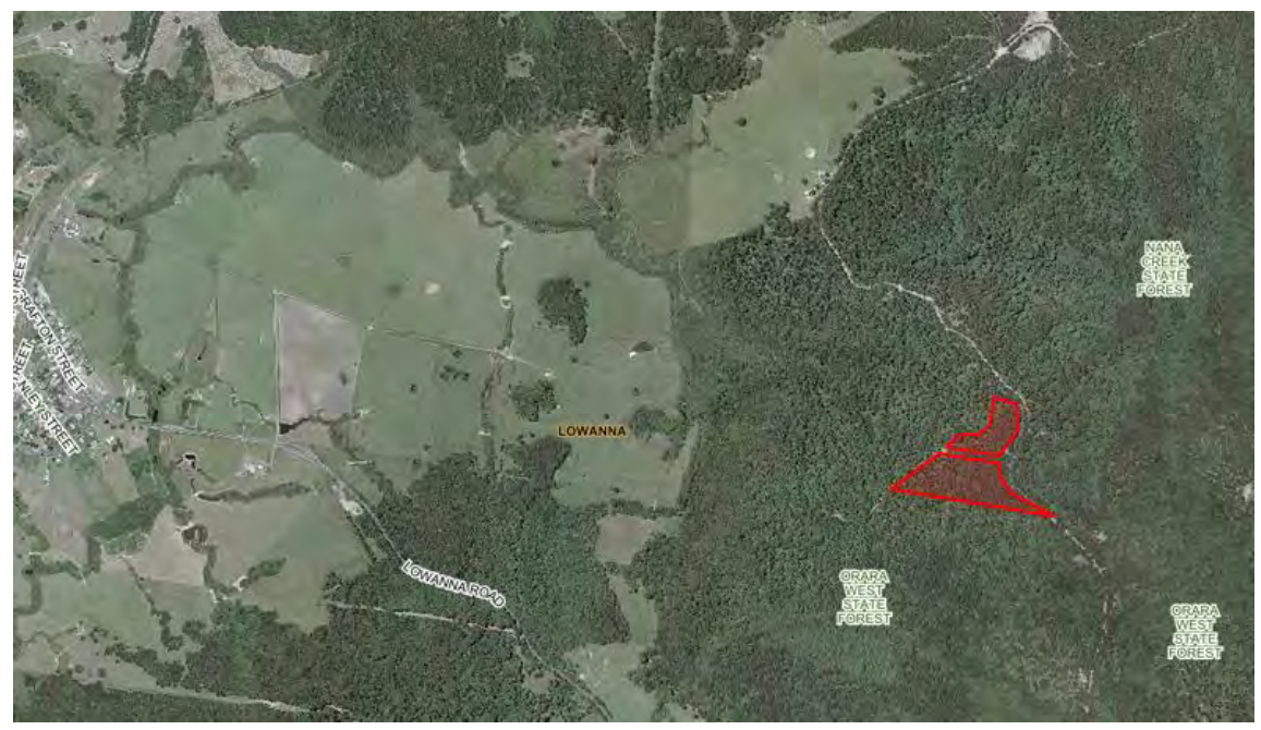
Figure 5.4.29: Aerial view Lowanna Orara West reserve R1002195

This reserve is in a reasonably isolated location covered in wet sclerophyll forest and is surrounded by the Orara West State Forest west of Lowanna village. There are no facilities or infrastructure located on the reserve other than burial sites, having once been a cemetery.