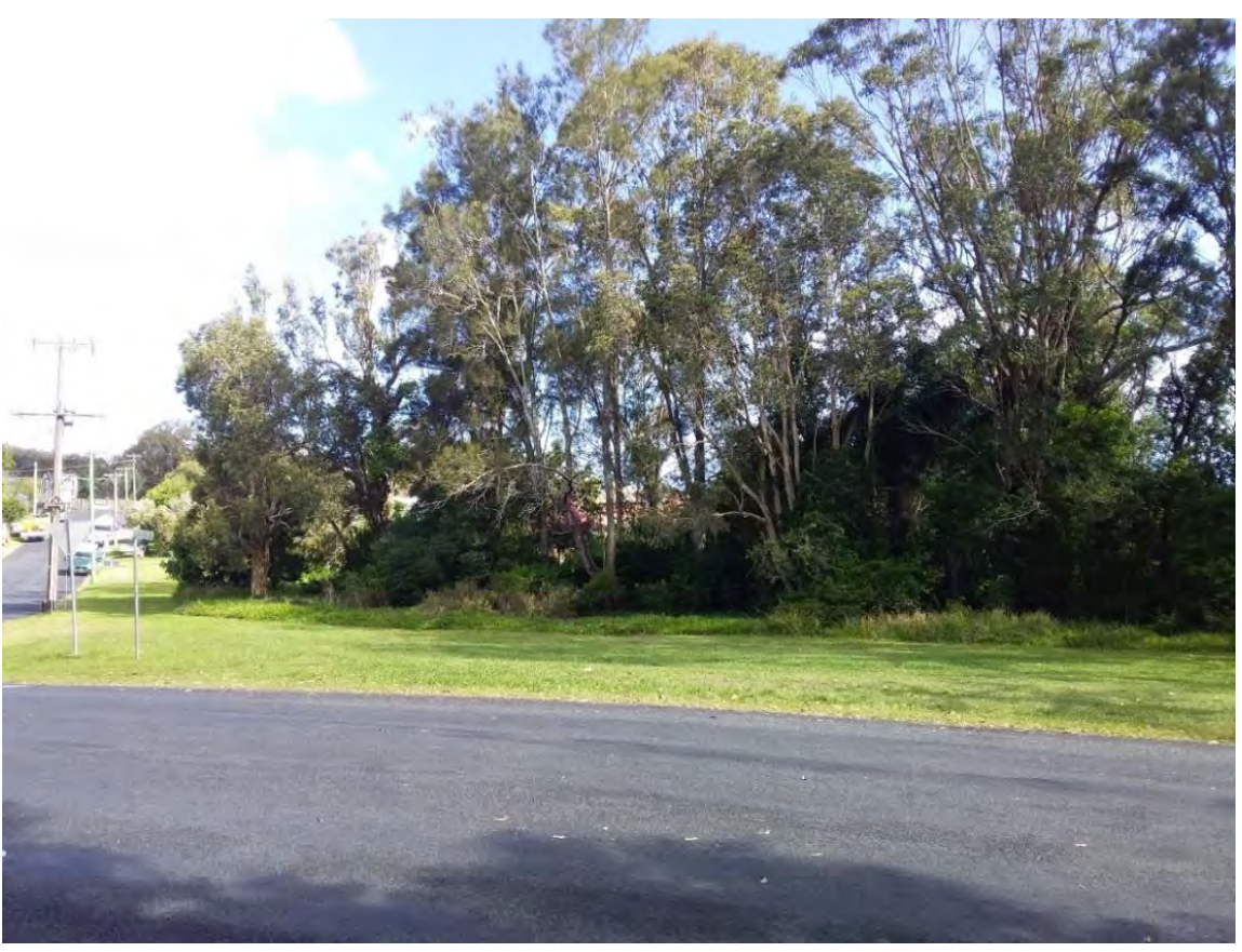
Figure 5.4.18: Street view Noomba Street reserve