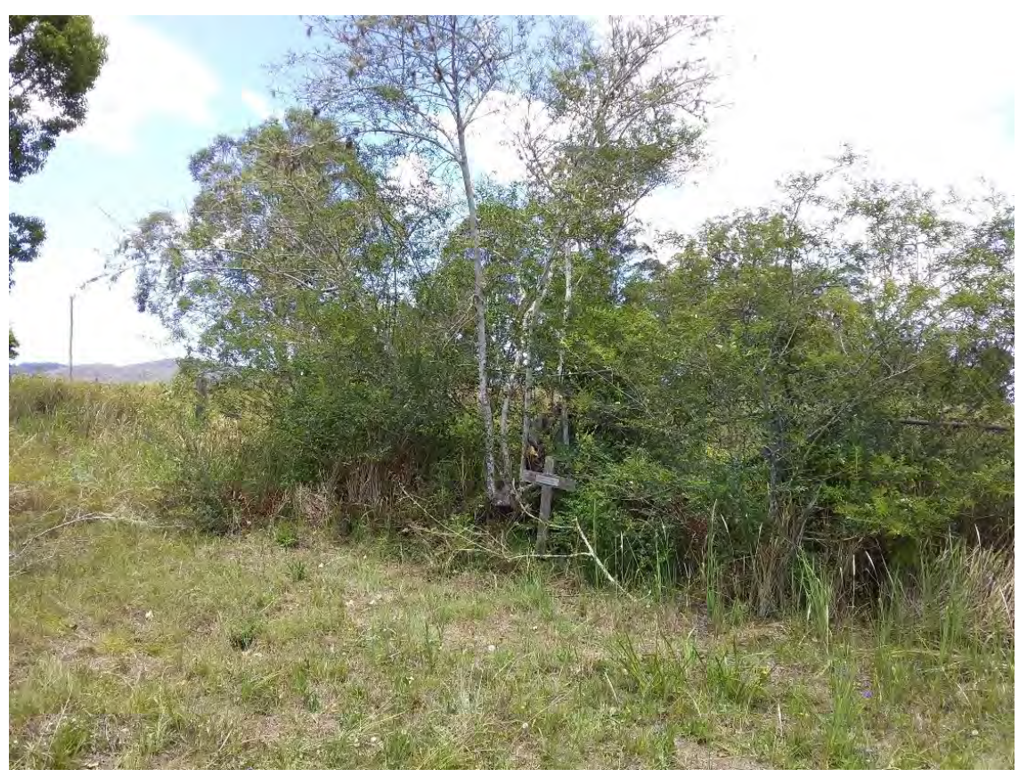
Figure 5.4.41: Only known remaining grave marker

A Title search revealed no encumbrances applicable to the land.