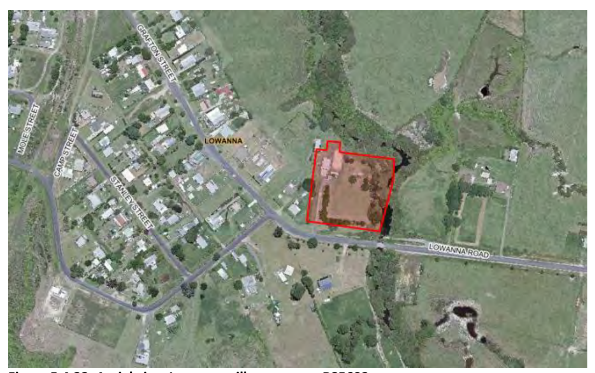
Figure 5.4.32: Aerial view Lowanna village reserve R85692

Flanked by the Little Nymboida River, the Lowanna Village Reserve is primarily used by the RFS which has its shed located on the land as well as a small playground, picnic table and recently upgraded public toilets. A tennis court that is now in a state of disrepair is also on the reserve.