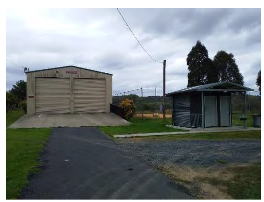
Figure 5.4.34: RFS shed and public toilets

The Coffs Harbour City Council Building Condition Assessment Report and Maintenance Schedule – March 2019 undertaken by civil engineering consultants GHD, rates the condition of the structures on the reserve in accordance with the categories outlined in Table 5.1.1 and rates the overall condition of the RFS shed as Category 2 'Good'. The toilets have been replaced since the GHD assessment was undertaken but would be classified as Category 1 'Very Good'.