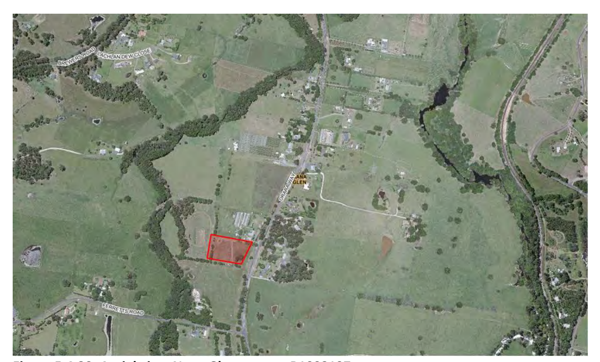
Figure 5.4.39: Aerial view Nana Glen reserve R1002197

The land has also previously been used for stock agistment by adjacent landholders although this is currently not occurring. The reserve is not generally utilised for any purpose by the general public and there are no facilities or infrastructure located on the land. It is rated as Category 3 Bushfire Prone Land.