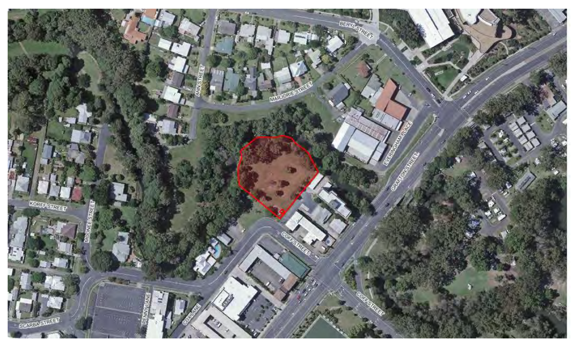
Figure 5.4.6: Aerial image Baden Powell Park reserve R87486