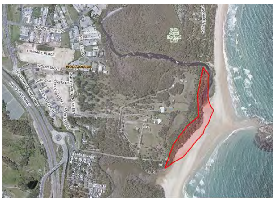
Figure 5.4.37: Aerial view Hearnes Lake reserve R74543

Immediately north of Hearnes Lake and extending to the southern end of Woolgoolga Back Beach, this reserve is densely vegetated ( Figure 5.4.37 ). Access is restricted to one track at the far southern edge of the reserve which exits into an informal parking area ( Figure 5.4.38 ) which then provides direct access to Hearnes Lake Beach/Flat Top Rock and Woolgoolga Back Beach. The western boundary of the reserve is set against private landholdings further restricting access.