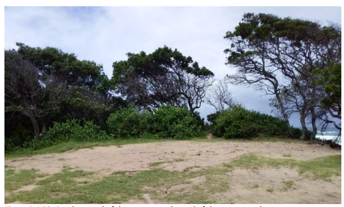
Figure 5.4.38: Southern end of the reserve at the end of the access track

There is currently no active Council management of the reserve. Future management may include invasive species control, vegetation management and or measures to manage public access.