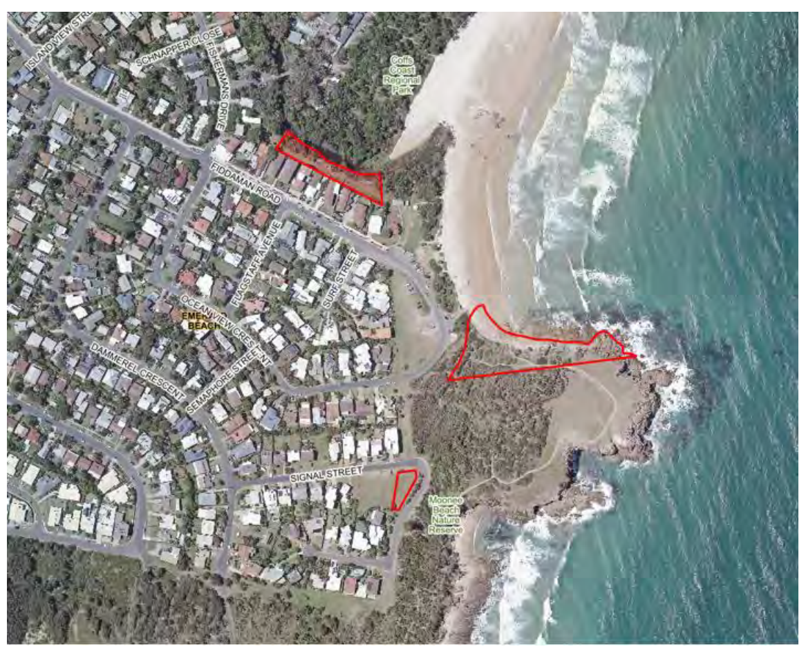
Figure 5.4.12: Aerial view Emerald Beach headland and Fiddamans Creek reserve R91331