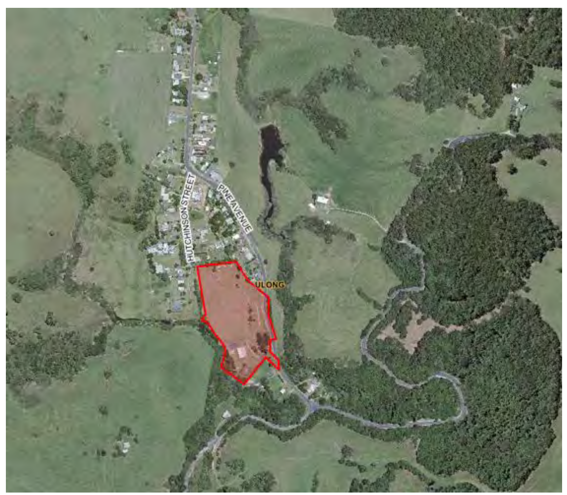
Figure 5.4.8: Aerial image Eastern Dorrigo Community Hall and Showground R89227

A Venue Management Committee (which is a Section 355 Committee, being formed under s.355 of the LG Act) is responsible for the care, control and management of the venue. Such responsibilities include but are not limited to, taking bookings, collection of fees, paying accounts, administration, contract cleaning, undergoing maintenance, maintaining an asset register and reviewing the Facility Business Plan. At the time of writing, the work of this committee is expected to continue into the future.