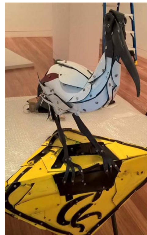
3D artworks also feature in the exhibition.