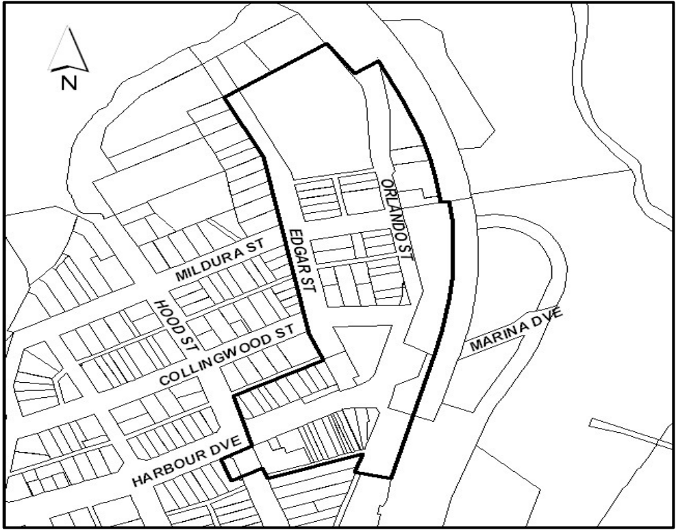
MAP 2 - Jetty Area Car Parking