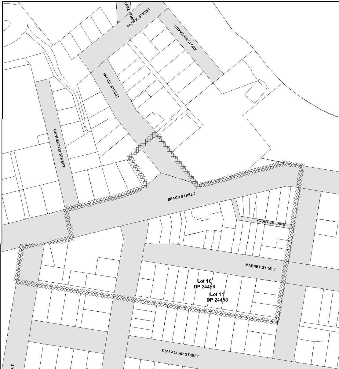
MAP 4 - Woolgoolga Town Centre Car Parking