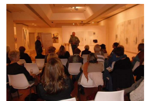
Above: Friends of the Gallery

Finally a little update on the Friends of the Gallery (inc). Although in their infancy the Friends are already planning a fabulous, fundraising and profile lifting event. Details will be revealed in their first newsletter. That their new patron (and the Gallery's) is internationally acclaimed pianist Roger Woodward is in itself cause for celebration. If you haven't joined, please do. You can pick up a membership application form at the Gallery on opening night. As Roger Woodward says You know you want to join your Friends! Hoping to see you at the Gallery.